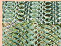
Mesh 'Butt' joined using U-pins