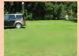
After installation - grass grows through quickly