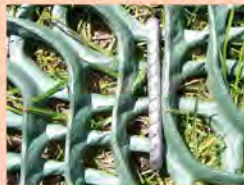
Secured with U-pins