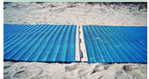
FIG. 4 - OVERLAPPING CONNECTOR STRIPS