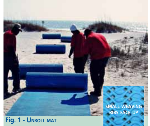
Fig. 1 - UNROLL MAT