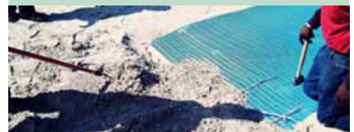
FIG. 3 - COVER ENDS WITH SAND TO PREVENT TRIPPING