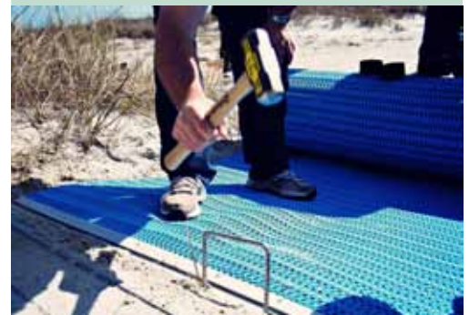
FIG. 2 - ANCHOR THE PATHMAT END WITH U-PINS