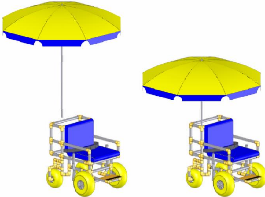
FIGURE1: INSTALLING THE UMBRELLA