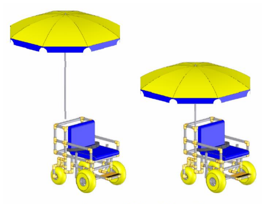
FIGURE1: INSTALLING THE UMBRELLA